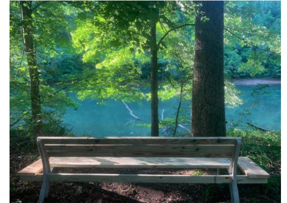
2 new benches installed at Park